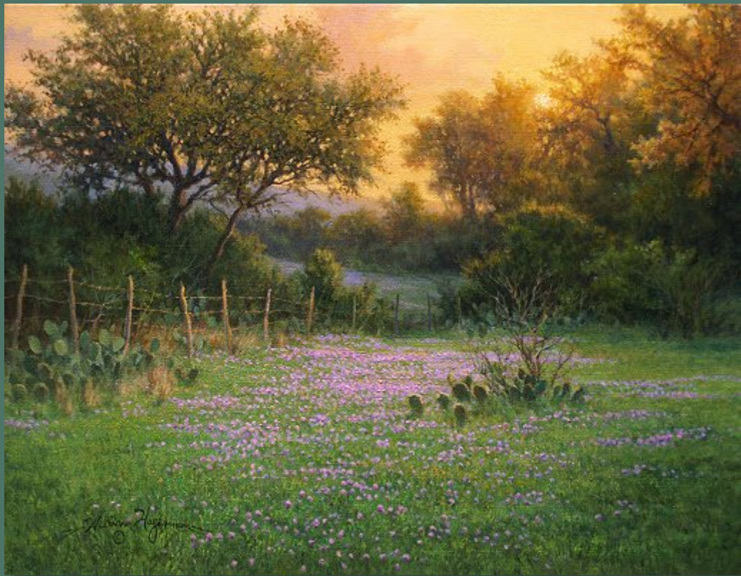
A Serene Evening 14 x 18 Oil - $2500.00

Most of my paintings are based on actual locations. This was also the case for this painting, however, no sooner had I started I realized the composition simply wasn't going to work. So I began the process of making a change here and a change there.