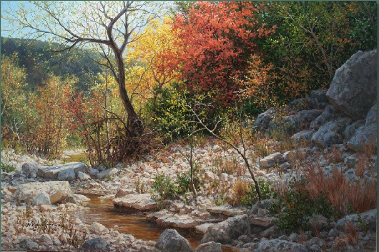
Radiance of Autumn 20 x 24 Oil - $4000.00

While hiking on private property (I had permission) I happened upon this scene and was immediately attracted to the sunlight filtering down from above and slightly behind the trees.