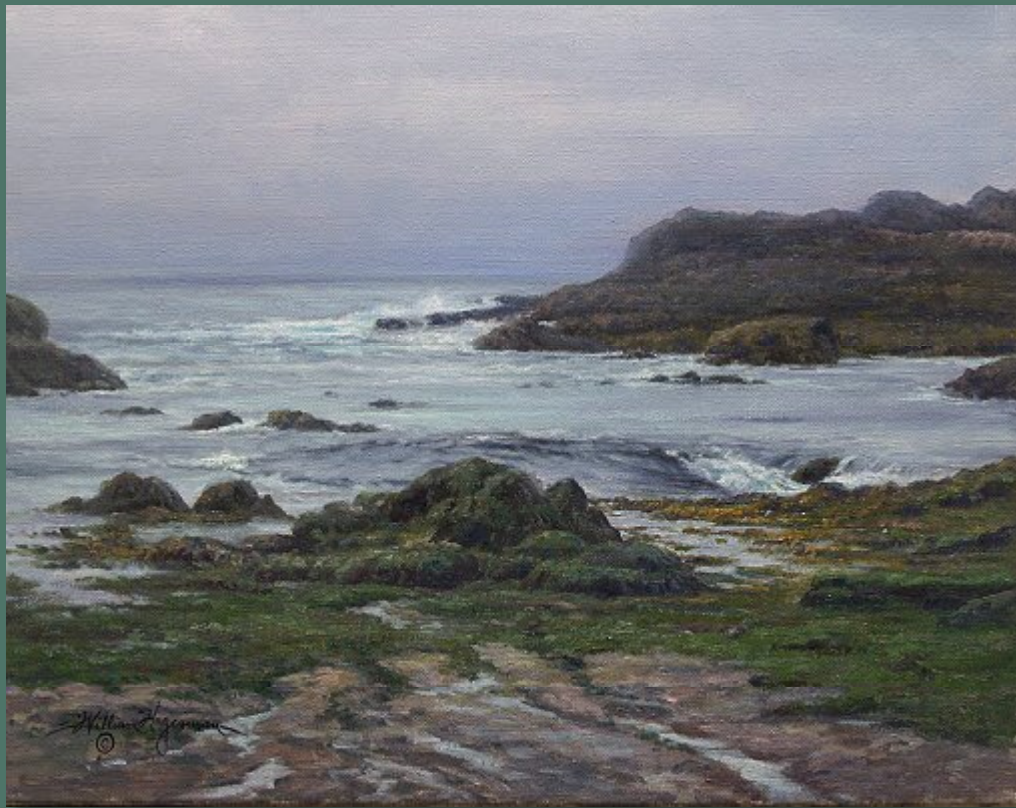
Coastal Greys 11 x 14 Oil - $2000.00

This is my first seascape. I had opportunity to visit the Monterey, California area for a couple of days. My wife and I were enjoying taking in some of the sights and doing a little hiking, which I over did. Even though the fog rolled in and obscured the sunlight, I thought the different greys of the land and pacific were still beautiful.