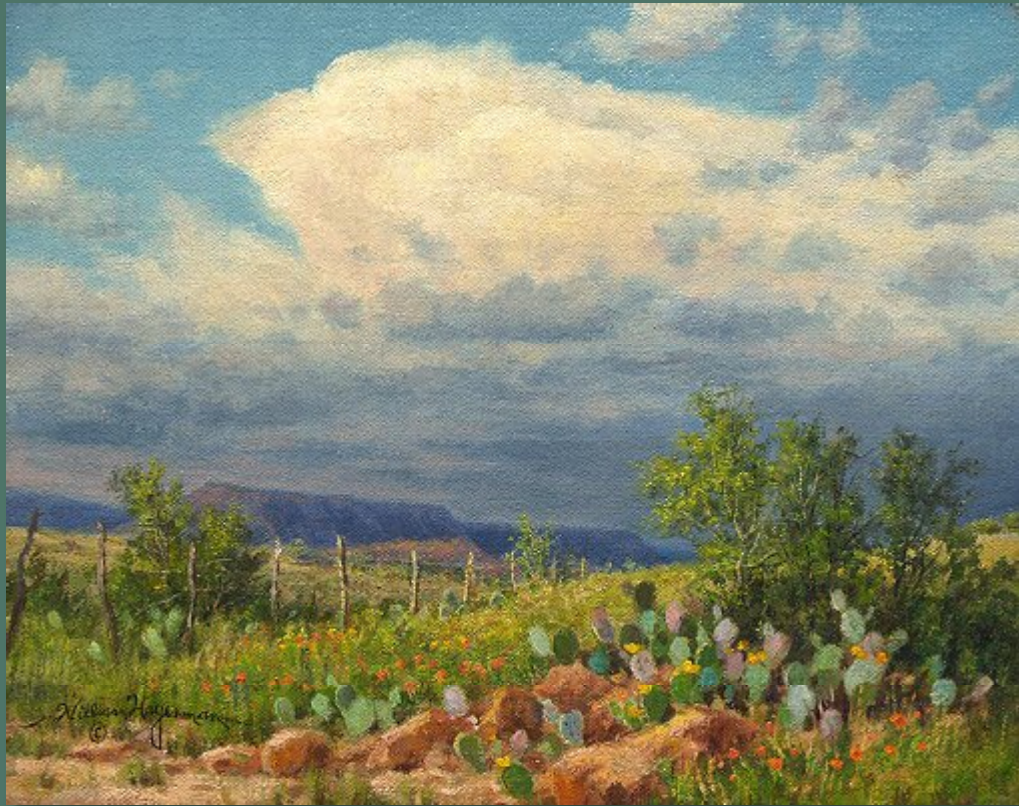
Isolated Thunderstorm Possible 8 x 10 Oil - $950.00

Here in West Texas we always seem to hear about the potential for isolated thunderstorms during Spring and Summer months.