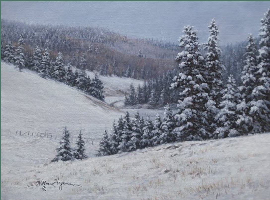
Snowy Silence 12 x 16 Oil - $2400.00

Somewhere between Eagle Nest and Red River, New Mexico was this scene. It was actually fall of the year, but this area had received some snow and this particular area was especially blessed with the white stuff.