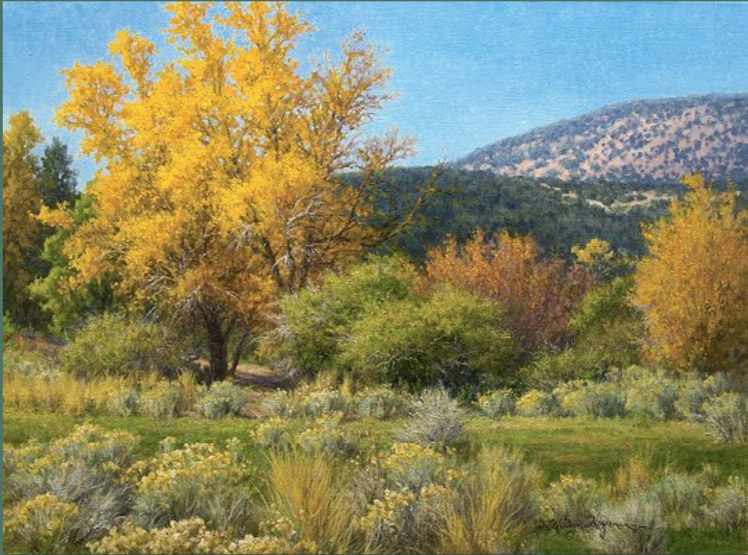
New Mexico Colors 18 x 24 Oil - $3000.00

Artists are always attracted to color and contrasts as these are integral qualities to a good painting along with good composition.