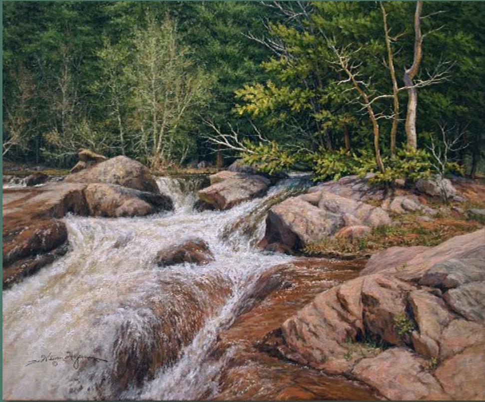
Melody of the Waterfalls 20 x 24 Oil - $3500.00

This is one of two paintings as a result from a trip to Colorado. The recent rains and snow melt transformed these falls into a loud melodious sound as the water spilled and splashed over the rocks.