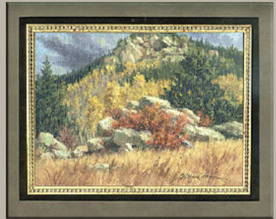
FALL COLOR NEAR MONJEAU 5" x 7" Oil $800.00

This is another painting derived from my first visit to the Ruidoso, NM area during the fall of the year.