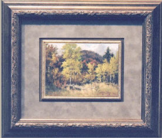
AUTUMN IN NOGAL CANYON 5" x 7" Oil $800.00

This painting was from my first visit to Nogal canyon near Ruidoso, NM. There was several lovely spots for painting. The shadowed background provided a nice element of contrast enhancing the sunlit trees. Also adding to the appeal of the area are the flecks of red color punctuated through this canyon from the red maple trees.