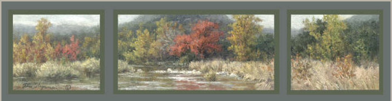
FALL TRIPTYCH Combined Image Approximately 2" x 8" Oil $800.00

I could not have asked for better weather. It was cool but the sun was warm and the scene had all the right elements. Even the clouds were in the right place. This area has provided me with several paintings.