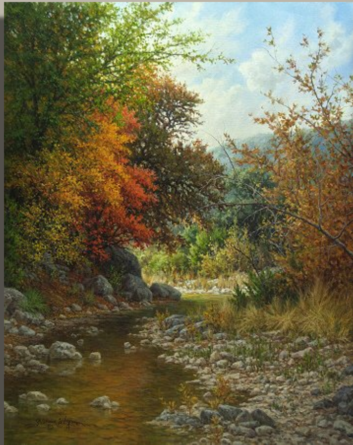
Exhibit and Sale Preview