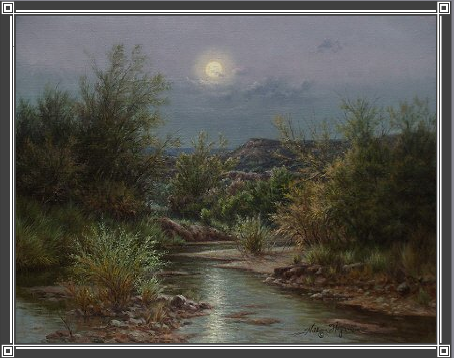
“Nocturnal Mood” 14” x 18” Oil