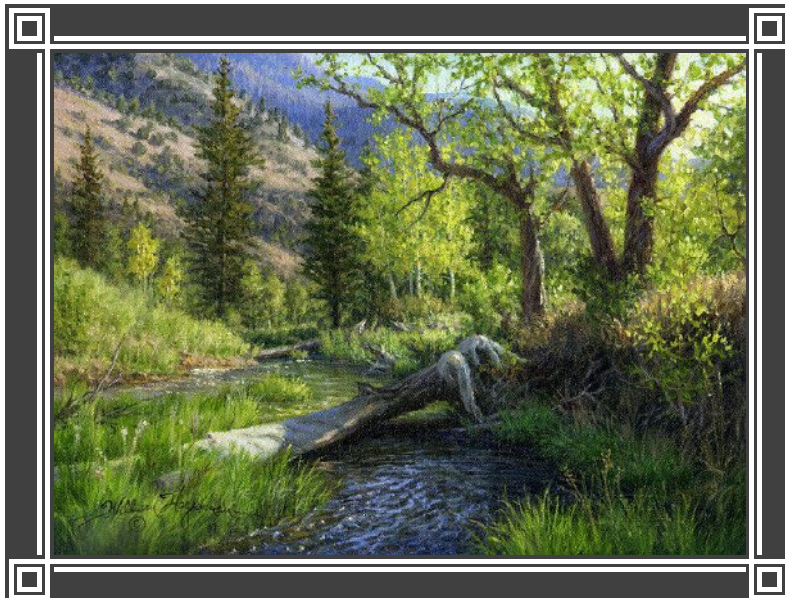
"Cool Morning" 9" x 12" Oil