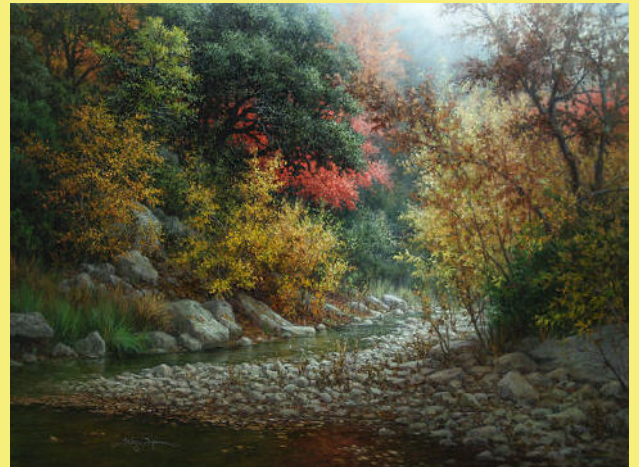
“Autumn Mood” 30" x 40" Oil $5500.00

The largest painting is shown at right. This 30" x 40" painting is based on a composite scene from Lost Maples State Park, located near Vanderpool, Texas.