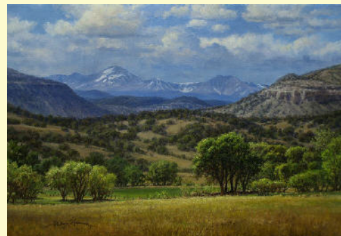
"Where the Plains Meet the Rockies"

The painting will also be included in the Haley Library & History Center Show and Sale opening Dec. 7, 2006.