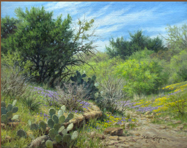
"Along a Dry Bed" 11 x 14 Oil $1950.00