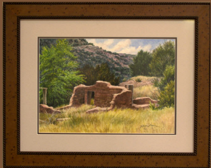
"Mills Canyon Relic" 14 x 20 Watercolor $1400.00