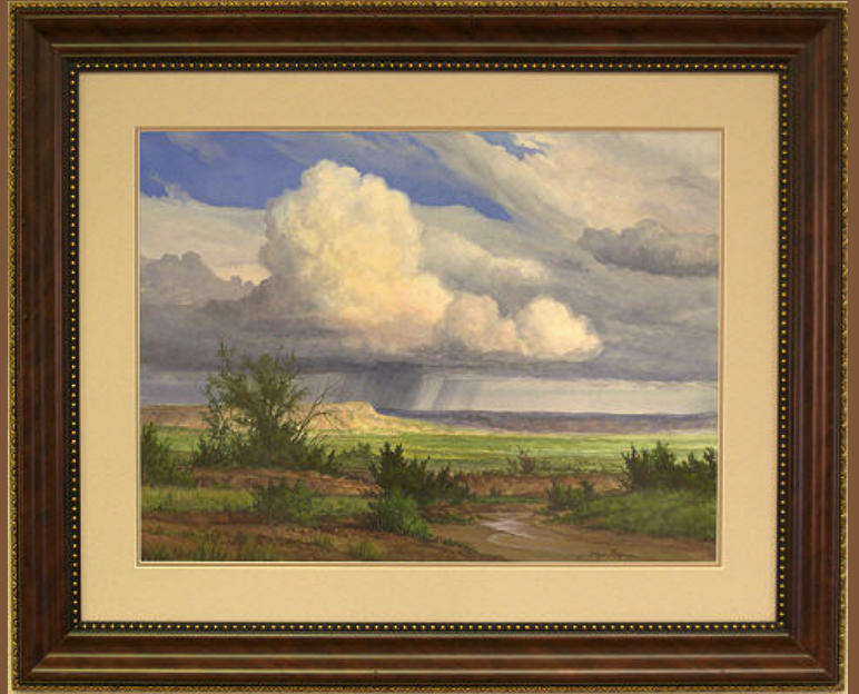
"Thunder on the Plains" 22 x 30 Watercolor $1900.00