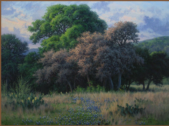
"Tranquil Spring Eve" 18 x 24 Oil $2500.00