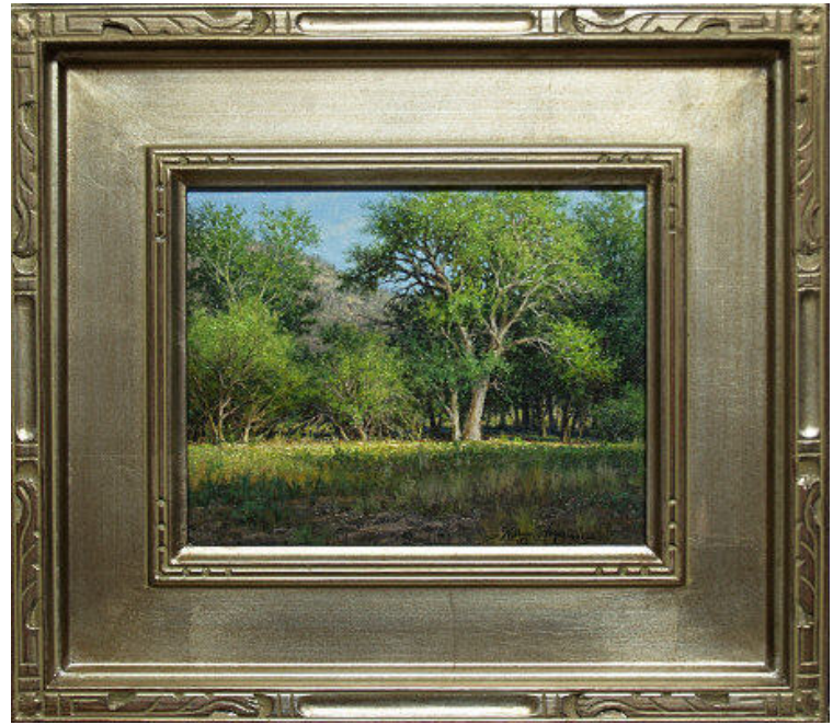
"Cottonwoods Near Dawson, New Mexico" 8 x 10 Oil