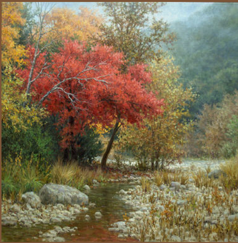
"Dressed in Red" 20 x 20 Oil $2500.00