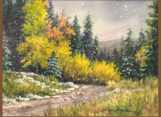
"Autumn Snow" 9 x 12 Watercolor $800.00