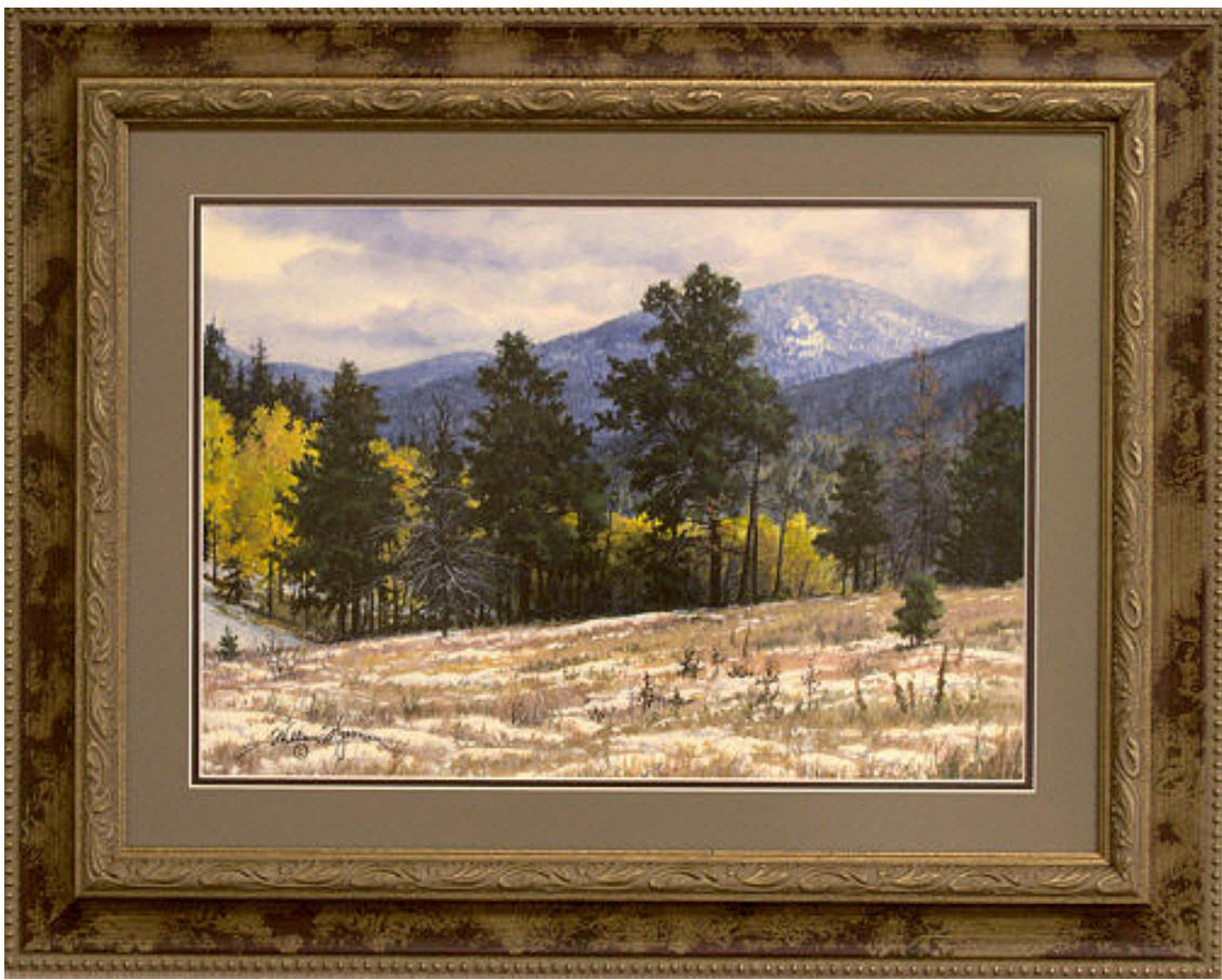
“Light Snow on the Valle Vidal” 14 x 20 Watercolor $1400.00