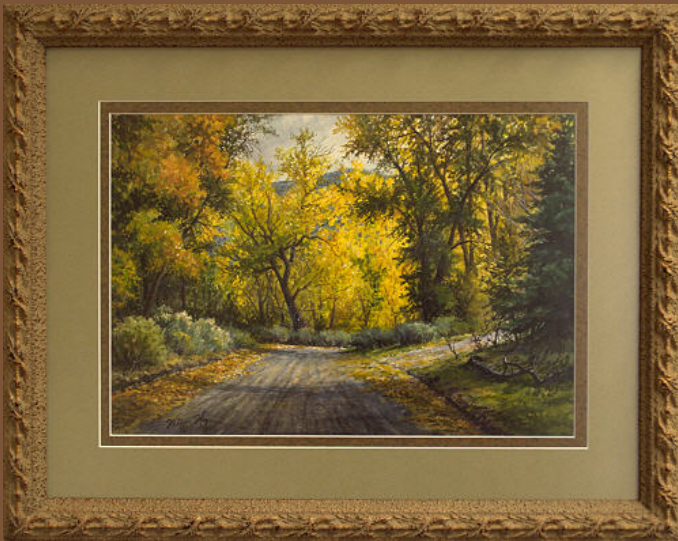
"Sparkle of Autumn" 14 x 20 Watercolor $1400.00