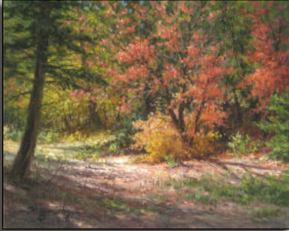
GLOWING MAPLE 8" x 10" Oil $875.00

While driving near Cloudcroft, New Mexico in mid October, I came across a sign that said Limited Access Road. That simply was just too tempting of an invitation to ignore. So I turned the wheel of my truck and thus began my jaunt down this very narrow dirt road. I had no idea where it ended nor did I really care. Wanting to see what would be around the next corner, my curiosity kept me moving forward.