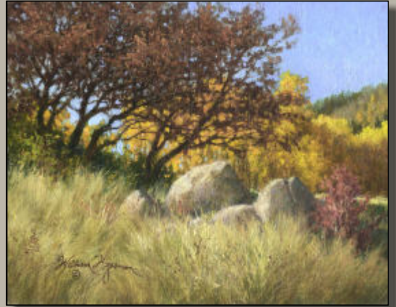
AUTUMN'S SONG 8" x 10" Oil $875.00

In a short time, the sun would be disappearing below the western horizon. As a prelude to this event and before the day could no longer be called day, the late afternoon light began to produce a melody of color and sparkling textures to my eyes.